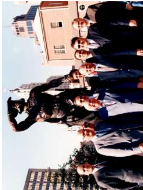
Columbus Statue Dedication 1987